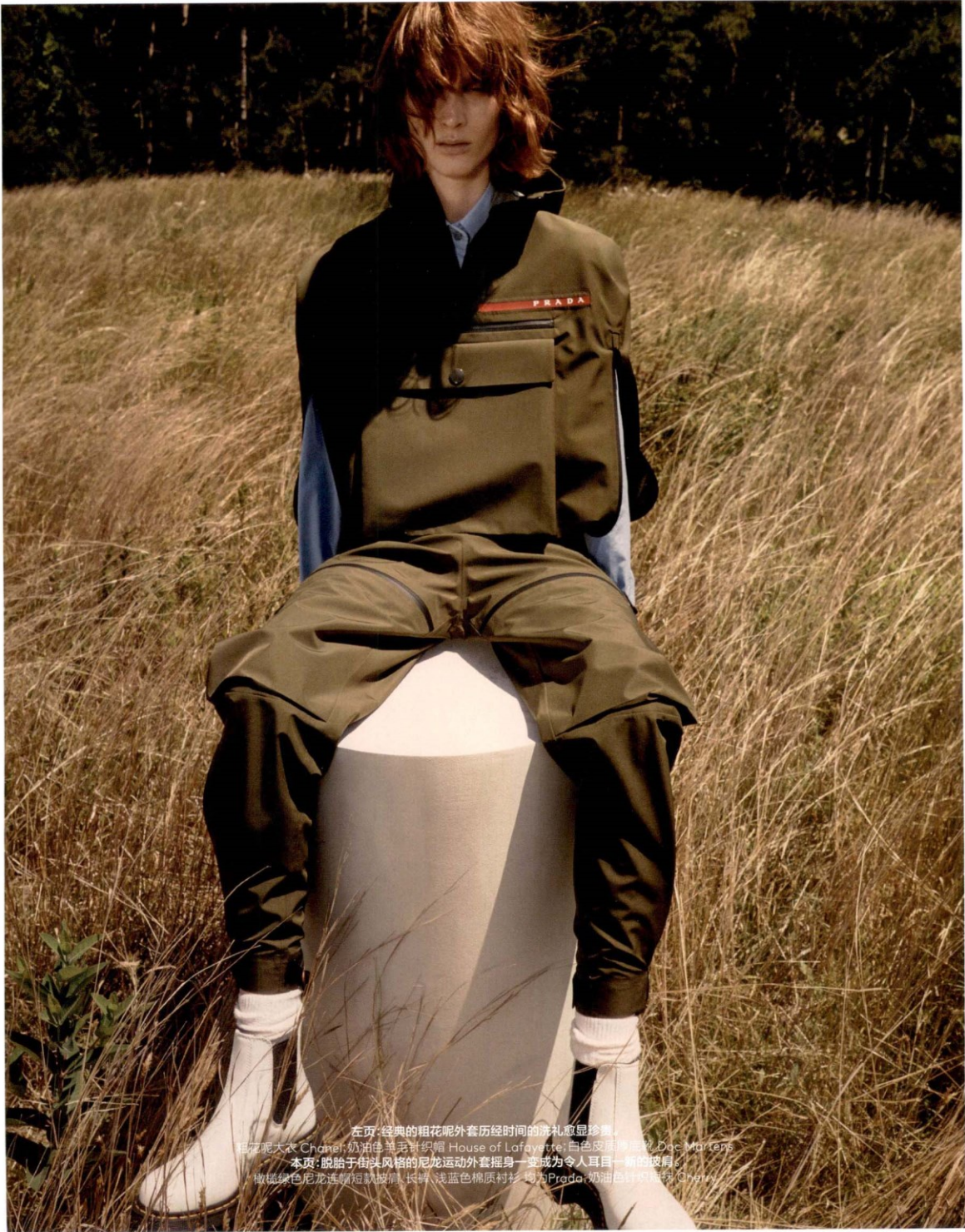
左页:经典的粗花呢外套历经时间的洗礼愈显珍贵。 粗花呢大衣 Chanel;奶油色羊毛针织帽 House of Lafayette;白色皮裙Dac Markers 本页:脱胎于街头风格的尼龙运动外套摆身一变成令人耳目一新的披肩。 橄榄绿色尼龙连帽短款披肩、长裤、浅蓝色棉质衬衫 均为Prada;奶油色针织帽Chanel