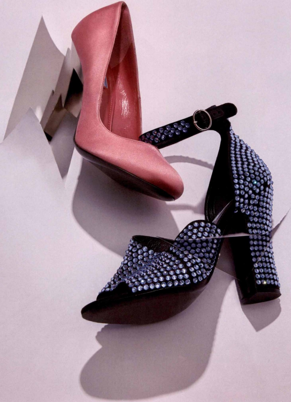
粉色缎面高跟鞋 蓝色丝袜鱼嘴鞋 均为 Prada