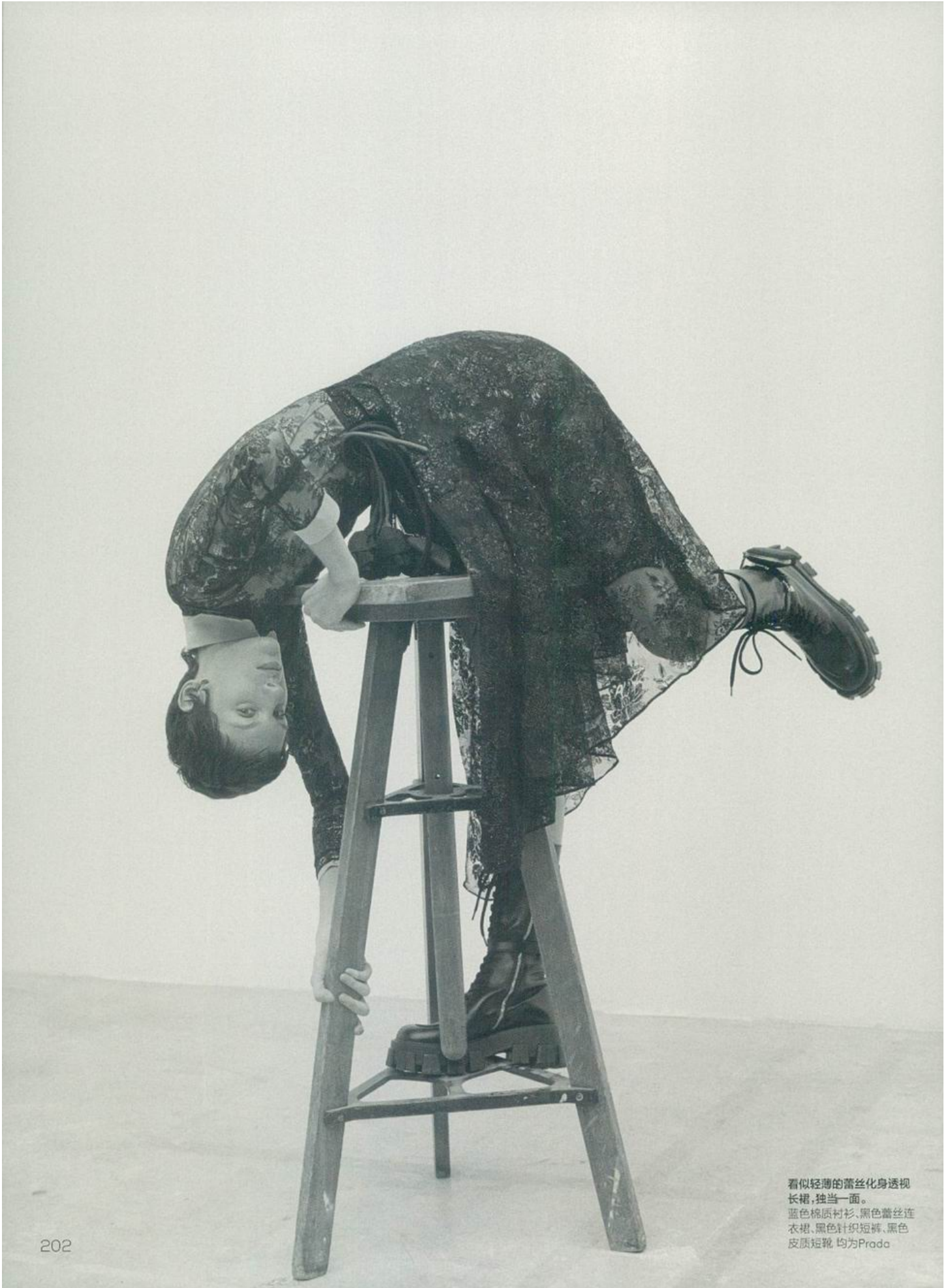
看似轻薄的蕾丝化身透视长裙,独当一面。 蓝色棉质衬衫、黑色蕾丝连衣裙、黑色针织短裤、黑色皮质短靴 均为Prada