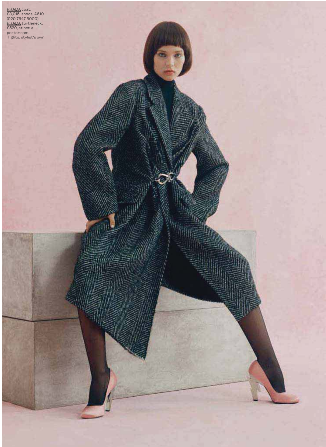
PRADA coat, £3,015; shoes, £610 (020 7647 5000). PRADA turtleneck, £520, at net-a- porter.com. Tights, stylist's own