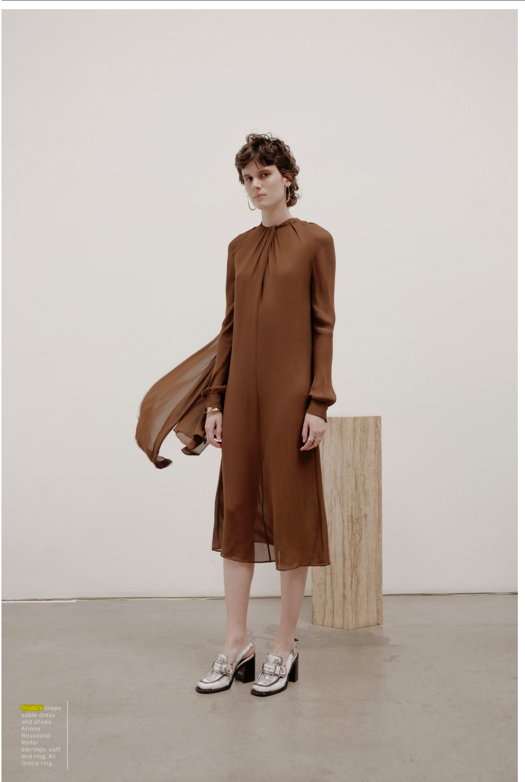
Prada's crepe sable dress and shoes. Ariana Boussard- Reifel earrings, cuff and ring; Ali Grace ring.