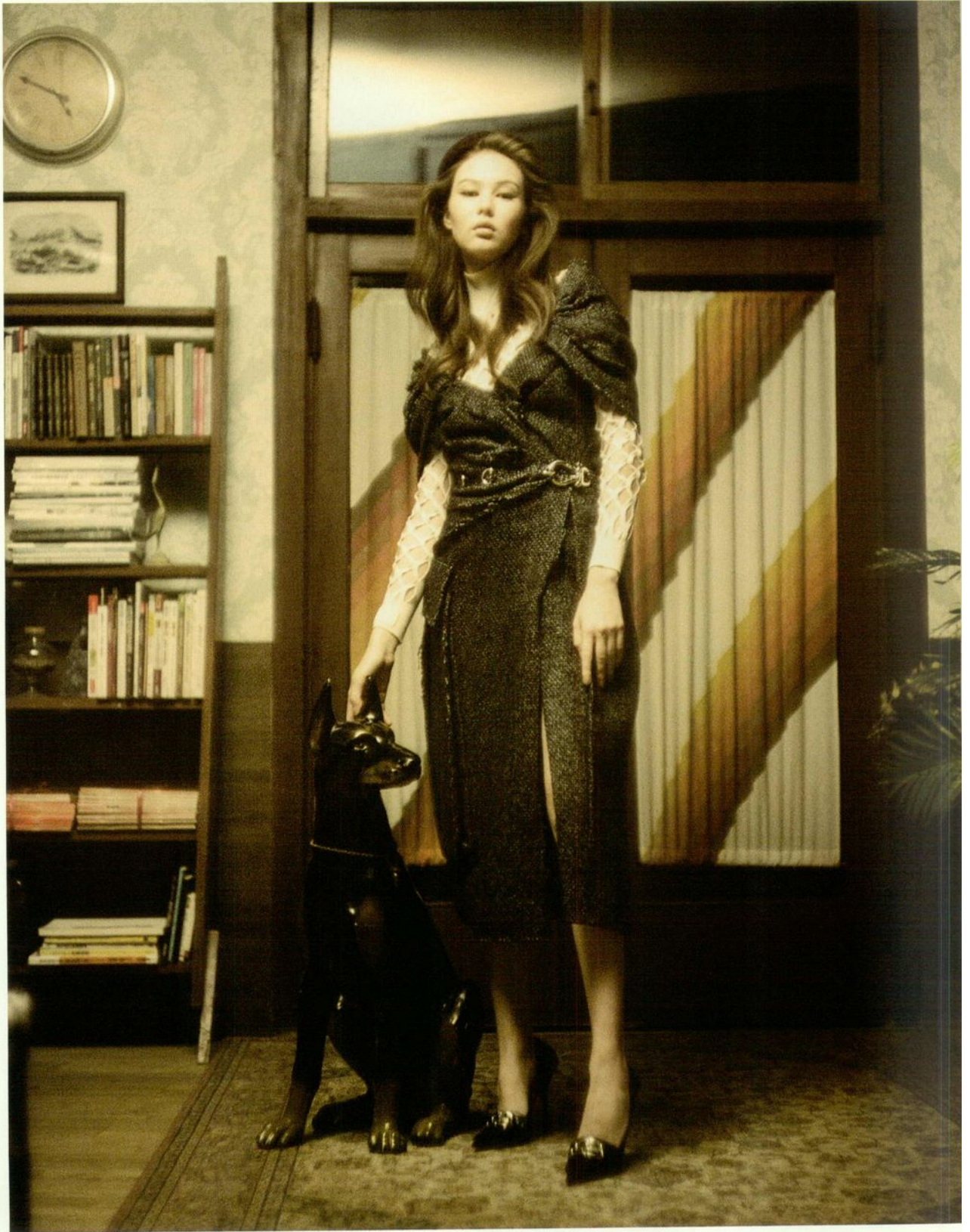
動物紋羊毛圓帽 · Eugenia Kim @ Net-A-Porter ; 菱格紋針織上衣 · Fendi ; 毛呢露肩洋裝 · Prada ; 尖頭高跟鞋 · Balenciaga