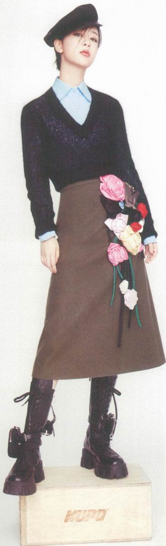
本页：深色针织毛衣、蓝色衬衫、彩色立体花朵装饰半裙、黑色长军靴，均为Prada；深色帽子 私人物品 右页：配色长大衣 Sans Titre