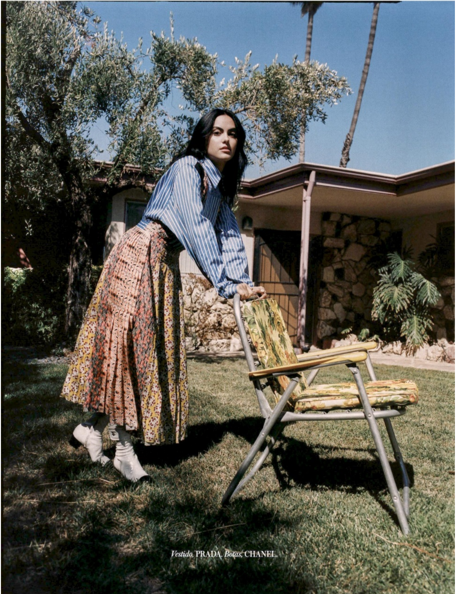
Vestido, PRADA. Botas, CHANEL.